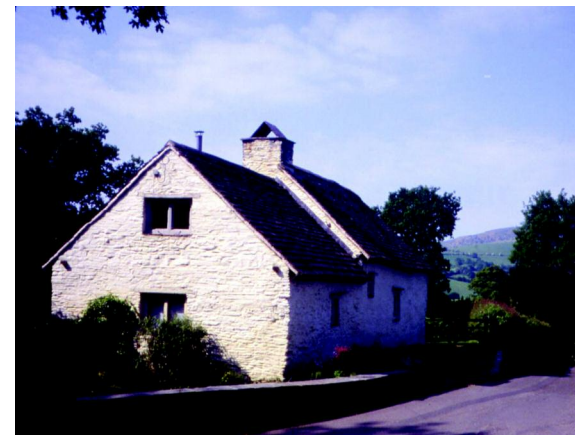
Old Forge, Llangattock Lingoed